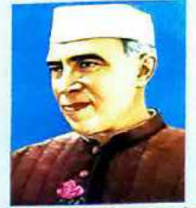
पहिले पंतप्रधान पंडित जवाहरलाल नेहरू