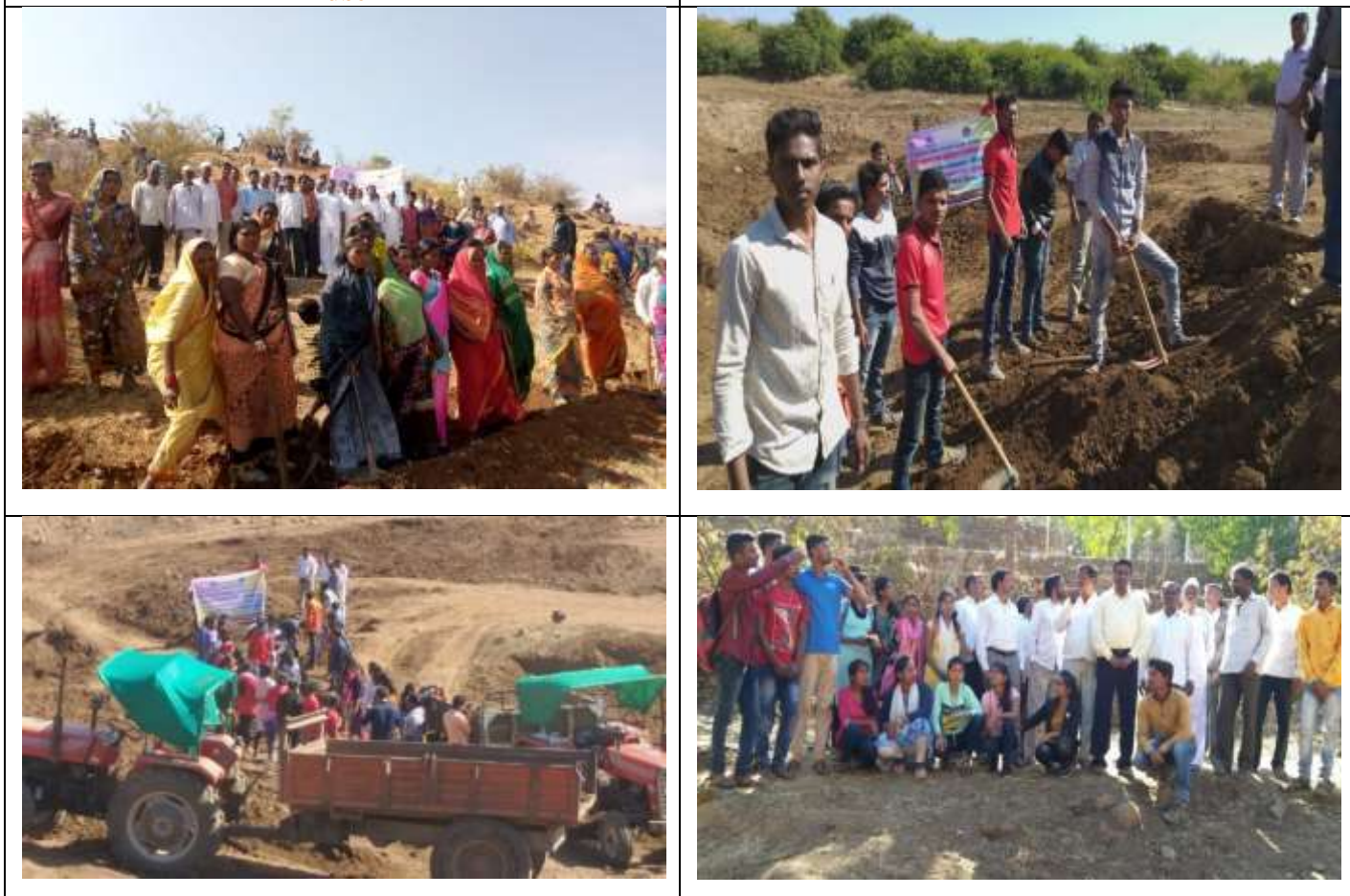
NSS Volunteers and Villagers doing work of Shramdan at Gevrai Kuber