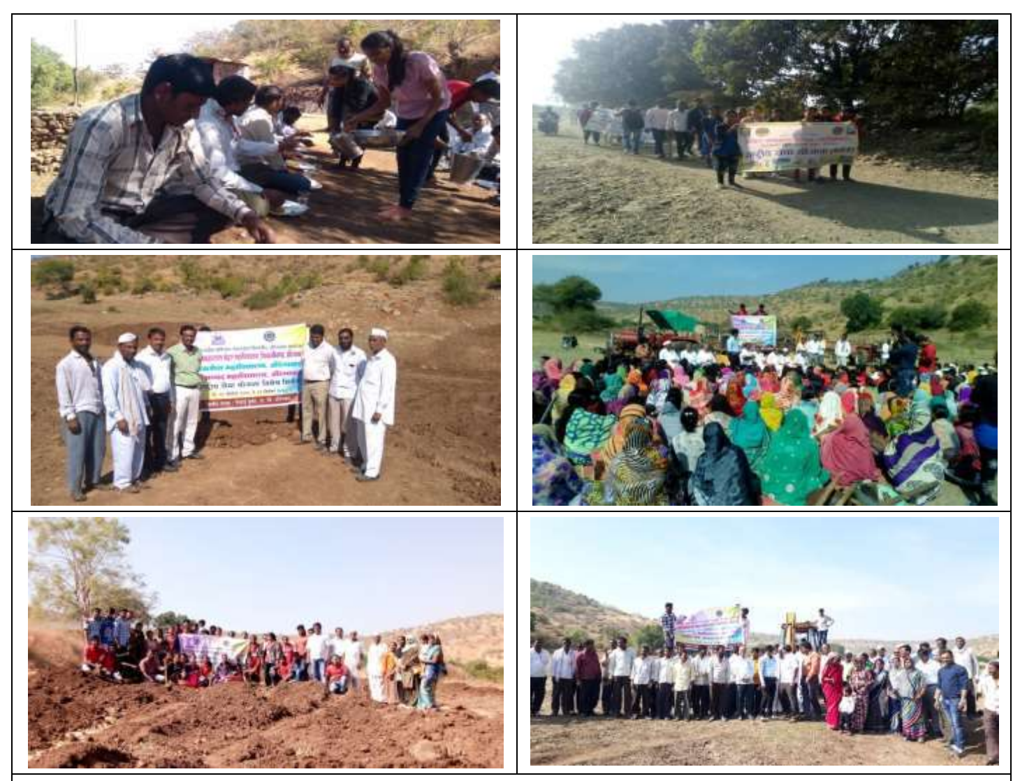
NSS Volunteers and Villagers doing work of Shramdan at Gevrai Kuber