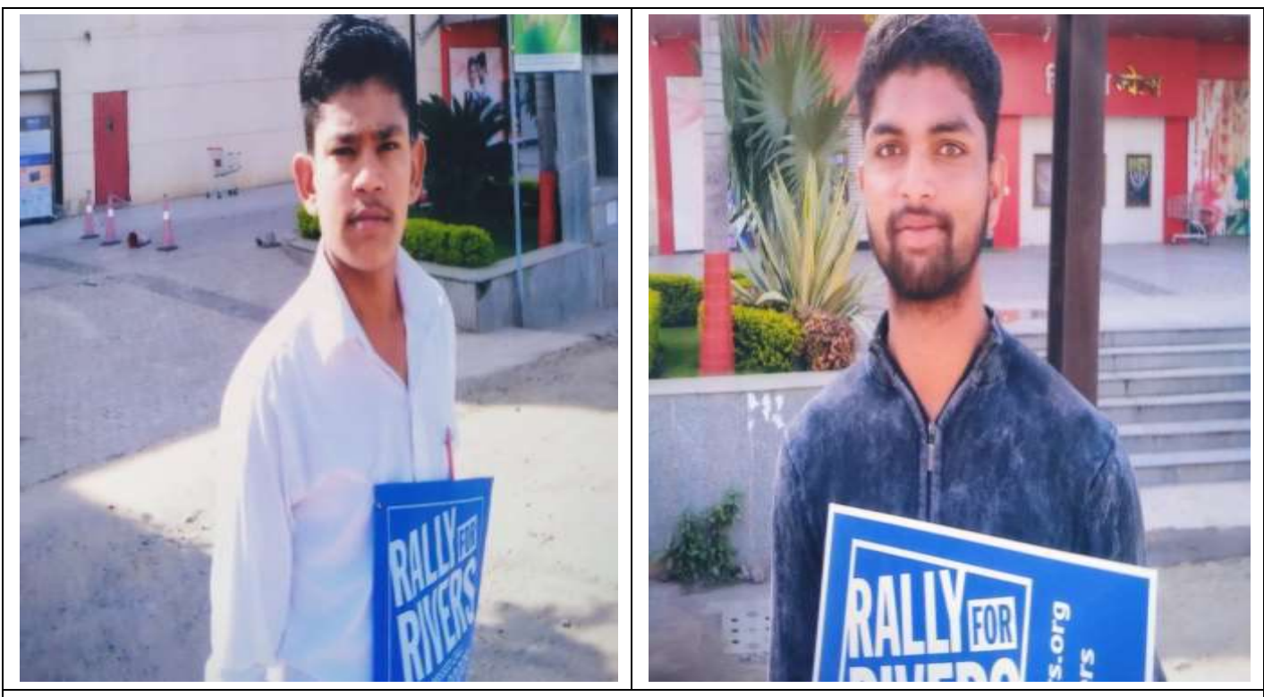
NSS Volunteers participated in the Rally for Rivers Campaign