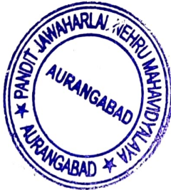
Principal Pandit Jawaharlal Nehru Mahavidyalaya Aurangabad.